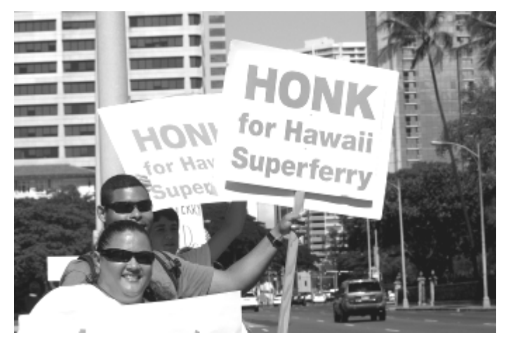
Hawaii Superferry employees and supporters held a sign waving rally on opening day of special session last week (above). Yesterday the Senate met in floor session to pass the Superferry bill on 3rd Reading. (top photo)

Final reading and decisions on all bills is expected to be done by this Wednesday, October 31.