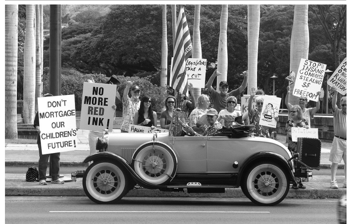
Dozens of concerned Hawaii citizens showed up at the State Capitol Saturday morning, September 12 to rally against some of the new federal and state proposals that will impact pocketbooks and lifestyle choices if enacted. Hot issues included nationwide public funded health care insurance, cap n trade, more taxes, and locally, legislative salary increases. Similar demonstrations were held nationwide with the main rally in Washington DC attracting more than 75,000 participants.

While President Barack Obama , the Hawaii Congressional Delegation, the Governor and the legislature are still supporting the "Native Hawaiian Government Reorganization Act" better known as the "Akaka Bill", a recent letter from the United States Commission on Civil Rights have come out in opposition of the proposal. In their letter they cite grave concerns about the constitutional authority to recognize racial or ethnic groups as dependent sovereign nations, unless those groups have a history of separate self-governance. They cited among other things, the Kingdom of Hawaii's 1840 constitution signed by King Kamehameha III stating that " God has made of one blood all races of people to dwell upon this Earth in unity and blessedness ". In other words the Hawaiian Kingdom was made up of more than just native Hawaiians. I remain opposed to the Akaka Bill.