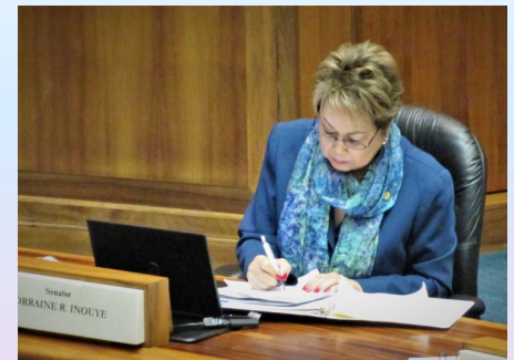
Taking notes before a speech on the floor.

Also not passing this year is the controversial water rights bill, HB 1326 HD2 which would have extended water permits for a number of farmers and the Alexander and Baldwin corporation.