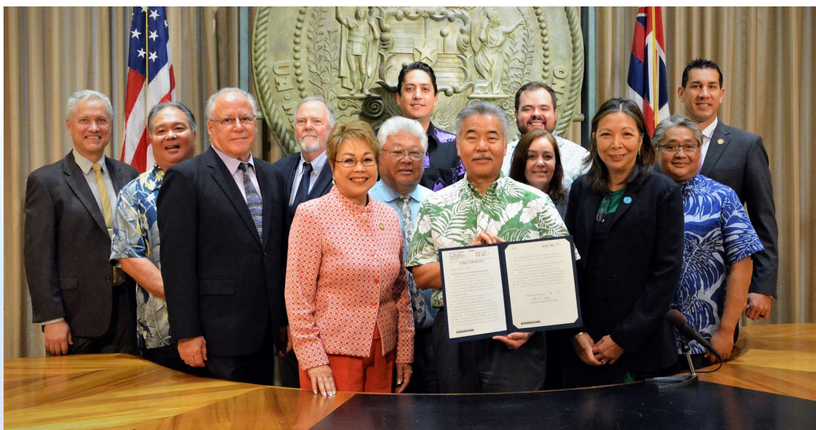
Governor David Ige signed HB 1180 SD 1 into law as Act 9 on April 16. Act 9 will provide the Puna district on the island of Hawaii with $60 million in disaster relief, recovery, mitigation, and remediation activities in the wake of the Kilauea volcanic eruption that devastated the area last year.