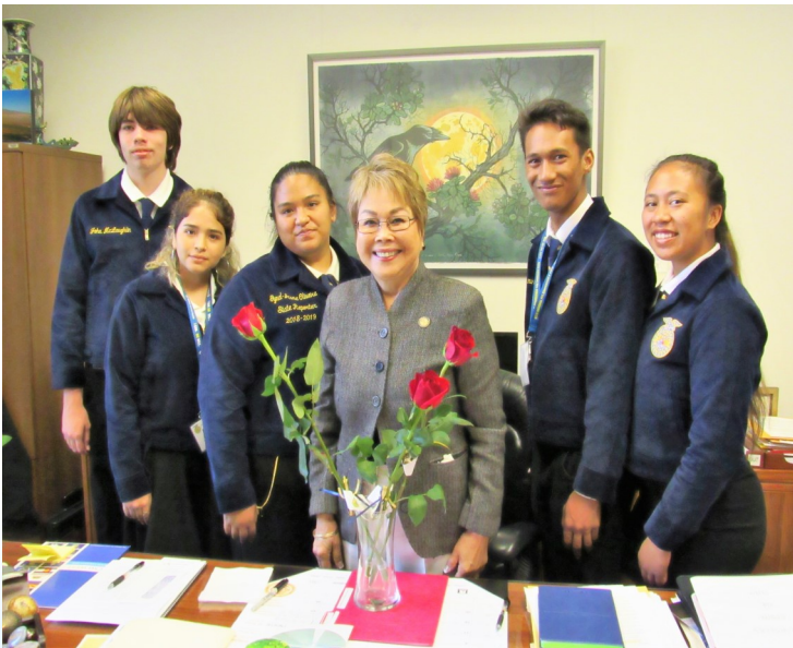
Konawaena School Future Farmers of America visited in April.