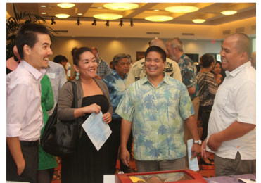
More than 200 people attended the annual SBH Awards Banquet held at the Waialae Country Club on September 20.