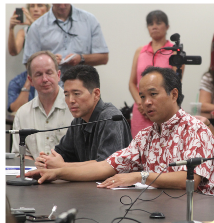
HECO officials testifying at the October 14 joint legislative informational briefing.

It is long past due to de-regulate HECO.