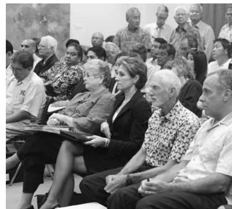
The crowd on the hearing's first day.