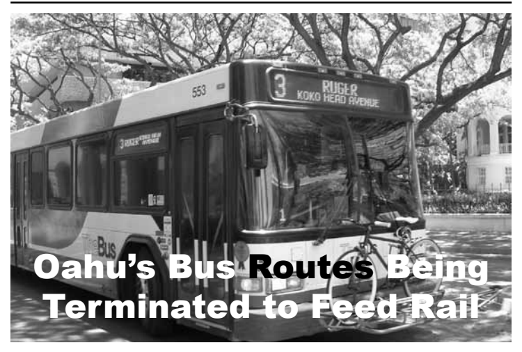
By Panos Prevedouros, PhD

personally experienced and touched, rather than a picture that can only be found in a textbook. This 5-member board is not above the rule of law, but Act 55 gives them the authority to be above rule of the law. As far as environmental review, in regards to rule of law, Act 55 – once again, fails the principles of democracy test.