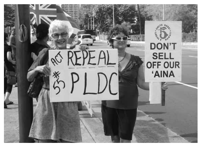
The implementation of Act 55 has sparked a number of protests at various venues throughout the State of Hawaii.

Hawaiian Sovereignty groups do not recognize the authority of the local government to make decisions about lands that were technically "stolen" from them during the overthrow of the rightful Hawaiian government almost 140 years ago. So in this aspect, our government has failed to get "consent of the governed" by these Hawaiian Sovereignty groups in dictating to them what will be done with public and ceded lands, which no one questions are supposed to be "reserved" for the people of Hawaii and Hawaiian descendants. Those who understand the history about how Hawaii came into existence to become a provisional