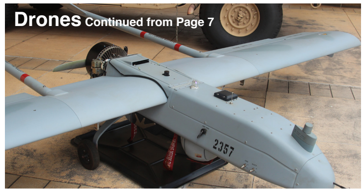
Drones Continued from Page 7