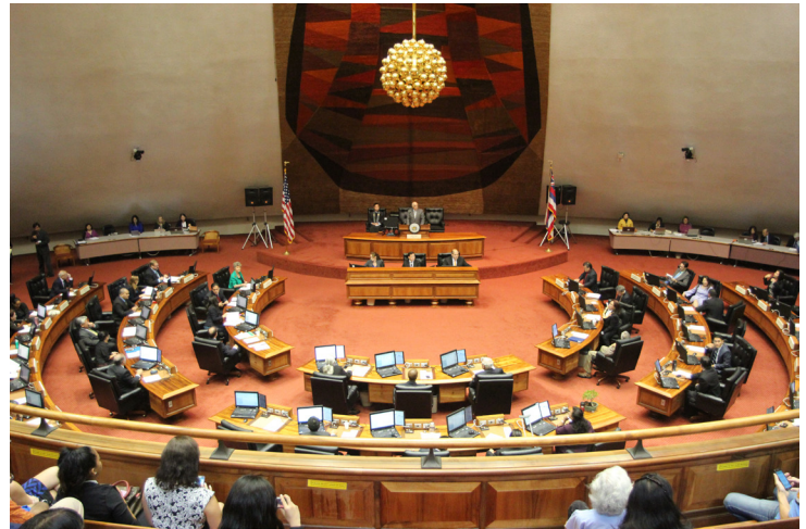
The legislature convenes once again at 10:00 am on January 15.

Closer scrutiny of the University of Hawaii, Hawaii Health Connector