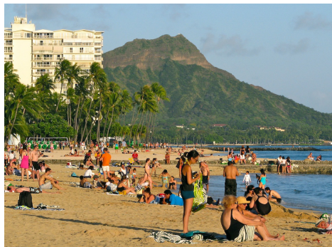
Is Hawaii as idyllic as it looks?

So-called advanced countries promote their greatness and vilify what are often deemed as less-sophisticated nations, but the sad truth is no matter what nationality, human nature is corrupt everywhere. For example, comments are always made about corruption in The Philippines and Indonesia, but never you mind about BAE Systems being accused of paying £115 million of bribes for a South African arms deal, or the British in general just placing a Union Jack here and there to grab resources and territory all over the world. Never you mind about the Daiwa bank scandal in which $1.1 billion of trading bonds were "lost", the Olympus accounting scandal and least of all Tepco's handling of nuclear power! At least the Indonesians are honest about having "fixers" where as more "polite" nationalities conceal sneakiness. But who cares, so long as they dress nicely and say pretty words in a courteous fashion, right? Lucifer was the most beautiful of God's angels