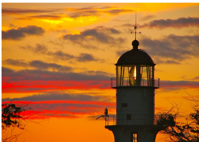
Sunset @ Diamond Head Lighthouse