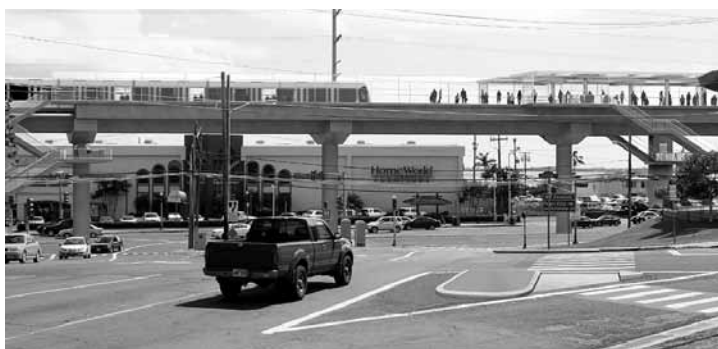
700 concrete pillars will be built to support the $5.2+ billion train.